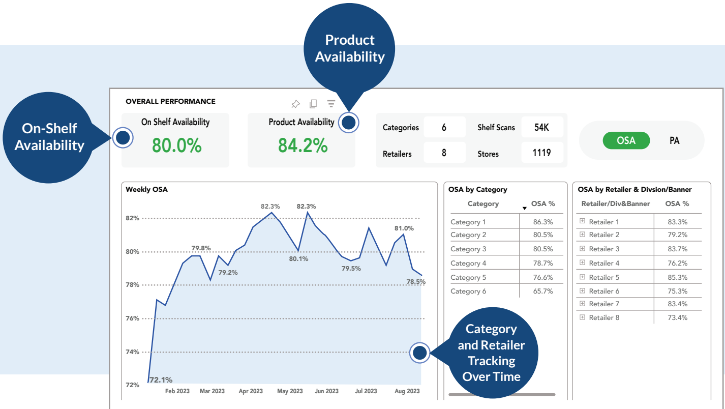
Pensa's Shelf Availability Dashboard

Pensa's patented computer vision and AI platform provides a highly accurate view of retail shelf conditions to grow sales and share.